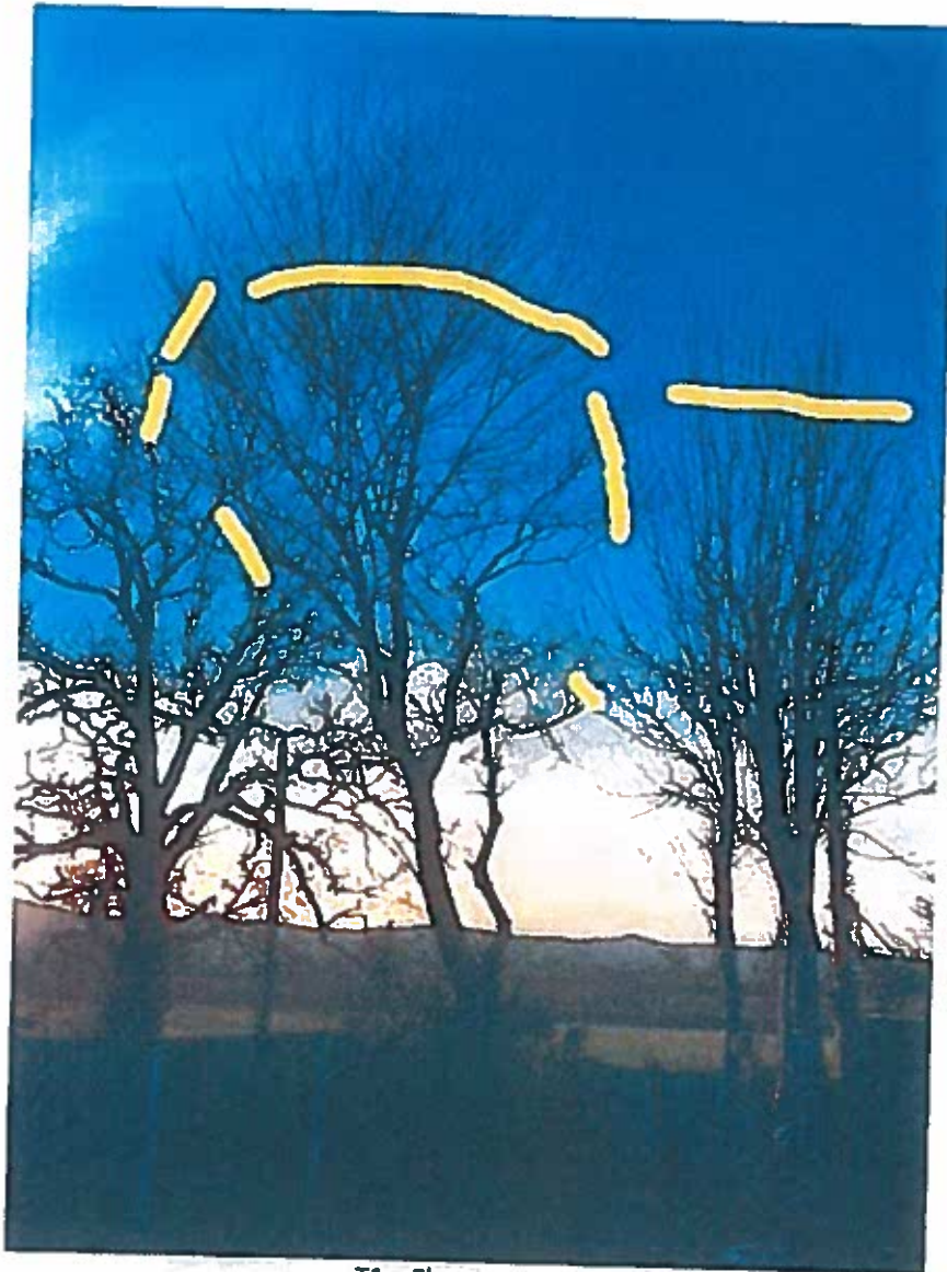
T1 - Elm