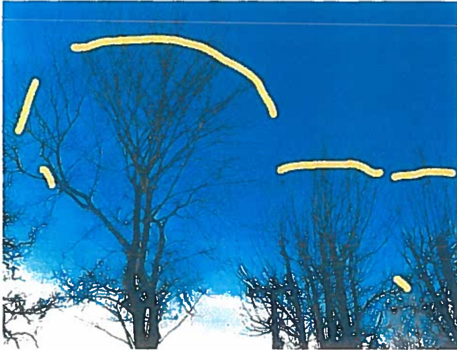
T1 - Elm