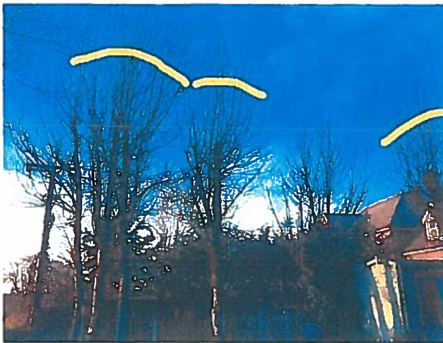
T2 - Sycamore